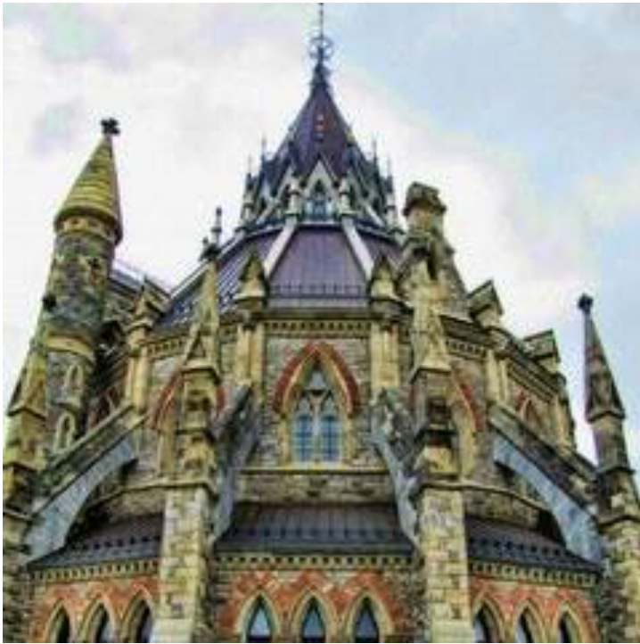
The Library of Parliament in Canada